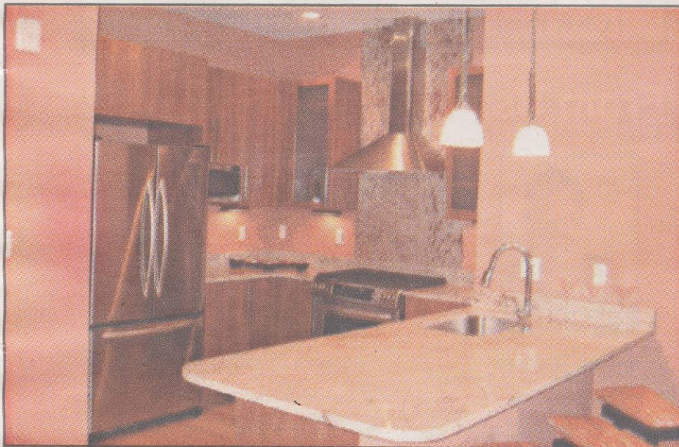
The open kitchen in the model unit showcases the granite counters, nutmeg cabinetry and stainless steel appliances.

In the model unit, the foyer flows into a large room that has been furnished as a living/dining area. Like all the condos, it has a 10-foot ceiling and bamboo flooring. Beyond the living room are single-pane French doors with sidelights that open onto a terrace. Originally con-