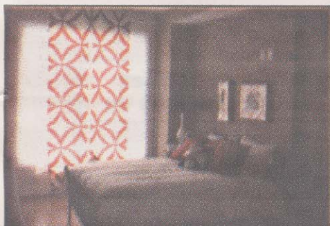
+ The master bedroom suite in this two-bedroom unit has a large closet, built on an angle, and an en suite bath with a glass-enclosed shower.

The steel-framed building of brick and cream-colored composite, was constructed on a 15,168-square-foot lot and features an interesting design that steps back from the street like the base of two lower-case Ws, creating an opportunity to provide glass-enclosed terraces with two exposures that don't look directly into the neighboring condo. The effect also interrupts the massing. Closer to D Street, the building rises four stories; otherwise, it is three stories high with a large common roof deck that residents can walk out to from the fourth floor.