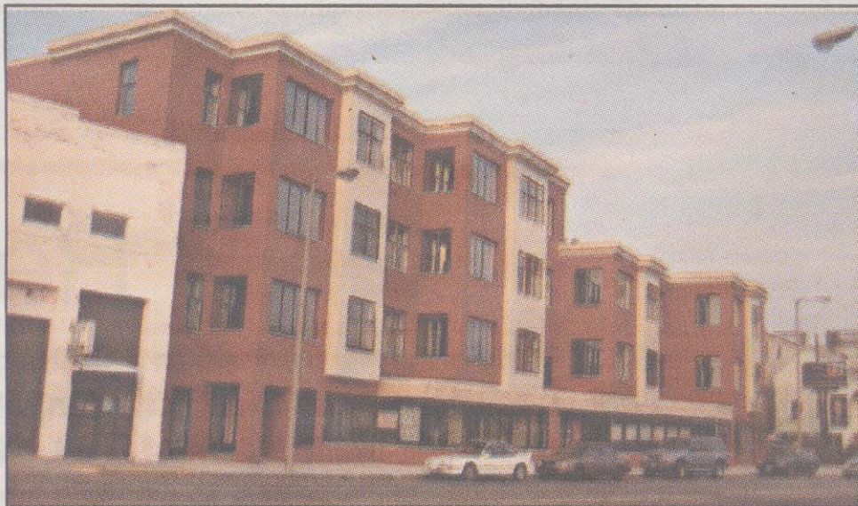
The new development at 152 Old Colony Ave. in South Boston comprises 24 residences, a below-ground garage and a first-floor commercial condo for a shop or an office. The complex also includes a residents-only fitness center.

ceived as an open-air deck, the developer, Patrick McDevitt, enclosed this area with 8-foot windows, thus expanding the living room further. From this room you can enjoy city views that include Back Bay skyscrapers in the distance. This unit faces Old Colony Avenue, a busy thoroughfare through an industrial area, yet the double-paned insulated windows block out street sounds.